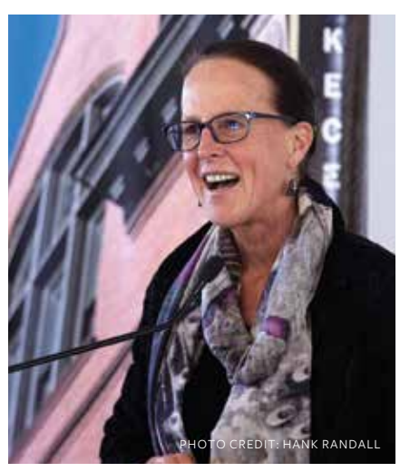
Wendy Brown explores the politics of naming.

Trans advocates argue that the language of "women" that these organizations use forces trans people to seek health care and reproductive freedom under a manifestly inaccurate gender sign and that these organizations are perpetuating the falsehood that the term "women" simply aligns with female anatomy.