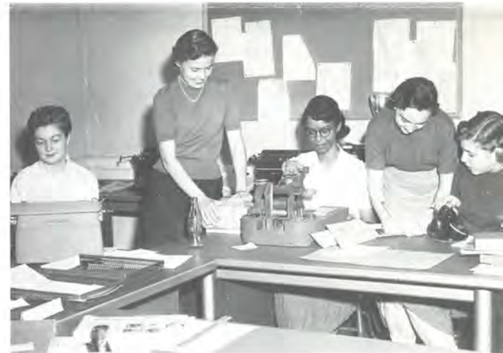
Five Pembroke women in the Record office in 1956. The Pembroke Record was published from 1922 through 1970 as a separate newspaper except for the World War II years when it merged with the Brown Daily Herald . This office is now part of the Pembroke Center.

Another reminder: we do like to meet alumnae when you come back to campus for meetings, to visit children, or reunions. In case some of you don't know where we are, the Pembroke Center occupies the top floor of Alumnae Hall, the space which in Pembroke days housed the Bruin Mael , Student Government, and The Record offices. We also make good use of the rest of Alumnae Hall—our research seminars are held in the Crystal Room, as are our Alumnae Forums, roundtables, and public lectures. This room is still one of the most attractive meeting rooms on campus; the women's college deans still adorn the walls, although portraits of Sarah Doyle and Dean