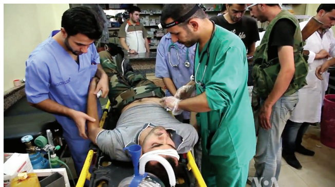
Doctors and medical staff treating injured rebel fighters and civilians in Aleppo, Syria.

A working group will examine a range of clinician-led and -affiliated social movements, such as: attacks on Arab doctors who are perceived to side with the rebels in the Syrian conflict; U.S.- and European-based surgeons who provide surgical care as part of social justice agendas in poor countries; race-based genomic medicine and attempts to address health disparities and inequalities with implications for pathologizing and medicalizing race and racial difference; and the socialization of doctors in the U.S. and the de-politicization of community health and social medicine. Faculty, postdoctoral fellows, and graduate students will engage in a year-long facilitated reading group and conclude with a symposium that brings together participants and invited scholars to workshop papers and new projects.