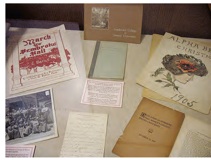
A small sampling of items you may find in the Christine Dunlap Farnham Archive

The Christine Dunlap Farnham Archive includes a rich array of materials for use in scholarly research: