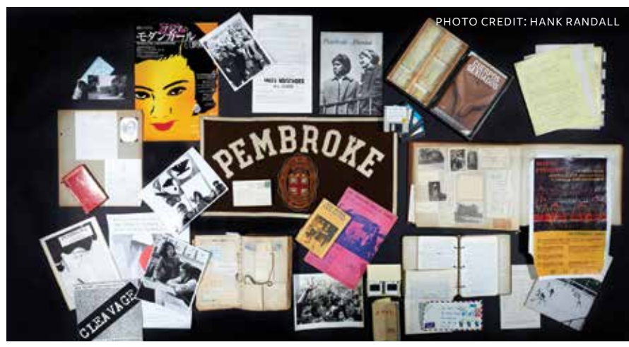
From the Christine Dunlap Farnham and Feminist Theory Archives