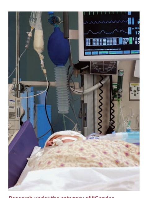
Research under the category of "Gender, Medicine, and Science" might explore how health technologies present unexpected challenges for some communities.

The Pembroke Center will announce funding opportunities as they become available. Brown faculty will be invited to apply. Application requirements will include: faculty project directors from at least two fields; a central research question or common issue that will serve as an umbrella for the group; a specific plan to involve other faculty researchers, visiting scholars, postdoctoral fellows, and graduate students; and, opportunities for undergraduate involvement. Applicants also will be