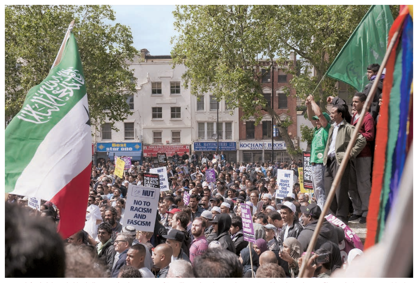
Research funded through this Challenge under the category of "Families and Workers on the Move" could explore urban conflicts and migrant communities in Western Europe. The photo above was taken at a June 2010 rally against the British National Party and the English Defence League in East London.

asked to describe the dissemination of individual and collective results through professional meetings, publications, and other activities.