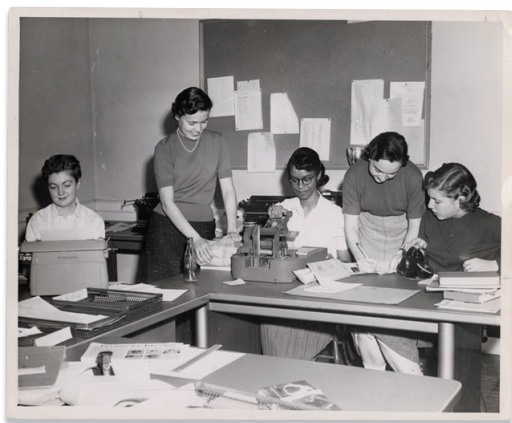
Pembroke Record staff, 1956