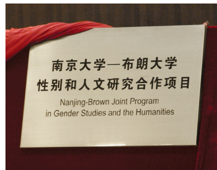
Unveiling of the Plaque Inaugurating the Nanjing-Brown Program

project. The Institute for Advanced Studies is well matched as a partner to the Brown programs. A new institute, it aims to break through traditional disciplinary constraints and to make intellectual connections across linguistic and cultural barriers. With an ambitious schedule of faculty and student exchanges and an exciting