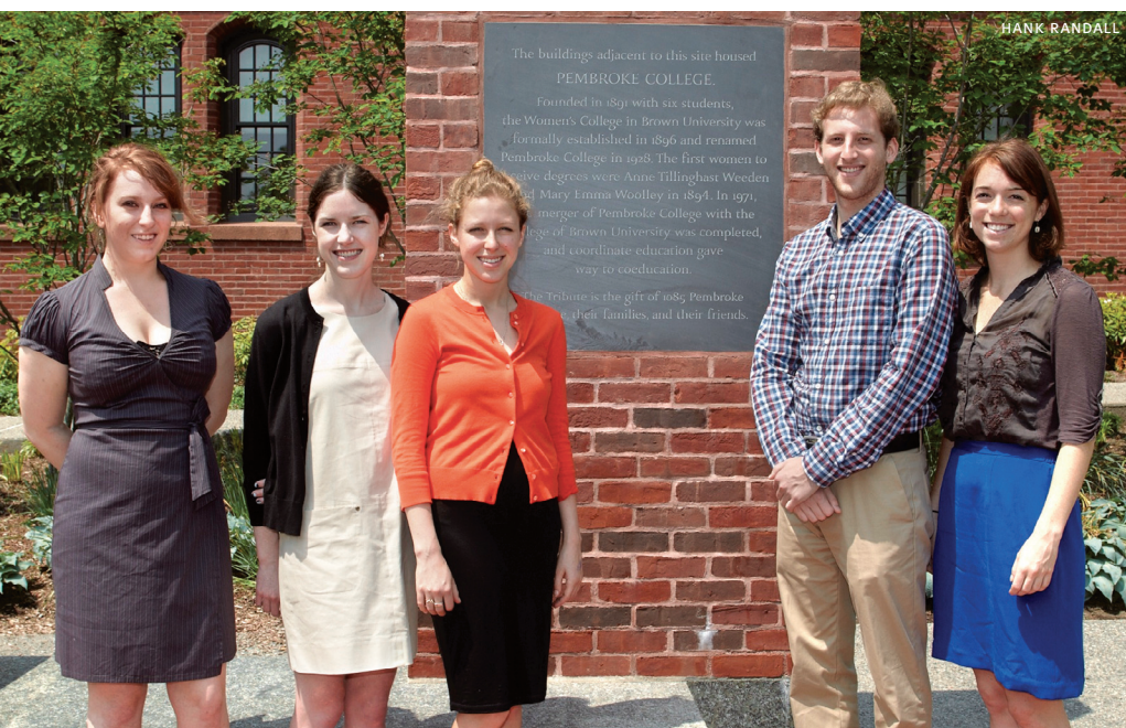
Recipients of student research grants and prizes funded by the Pembroke Center Associates stand next to the Pembroke Tribute.

As the Pembroke Center commemorates its 30th anniversary, we are pleased to publish a short history of the Pembroke Center Associates. Membership donations make it possible for the Center to provide Brown faculty, students, and postdoctoral fellows with funding, scholarly forums, publications, courses, and archives that are the lifeblood of innovative research and teaching excellence. In addition to providing direct support of the Center, the Associates offer programs and produce publications that allow the entire Brown community opportunities to become engaged with the Center's work.