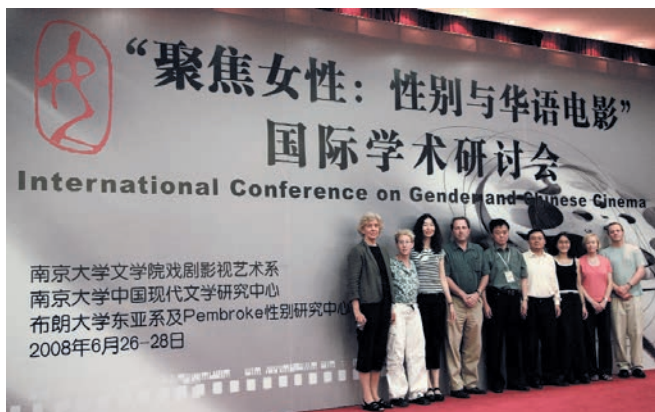
Scholars from Brown and Nanjing Universities at the Gender and Chinese Cinema Conference

During a visit to China this summer, the Pembroke Center for Teaching and Research on Women, the Cogut Center for the Humanities, and the East Asian Studies Department entered into an exciting partnership agreement with the Institute for Advanced Study in the Humanities and Social Sciences at Nanjing University. The joint focus on gender studies and the humanities is informed by strong current motivations in Chinese intellectual life related to constructions of citizenship in the successive periods from the advent of socialism to the Cultural Revolution to the current era of reform and globalization.