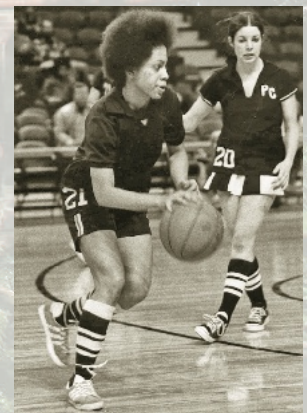
Basketball was one of the sports that began official Ivy competition in 1974

Official Ivy competition begins in women's sports, 32 years after men's competition began, although the women's competitive teams had existed since 1903. Women's Crew wins the first Ivy Championship in the sport.