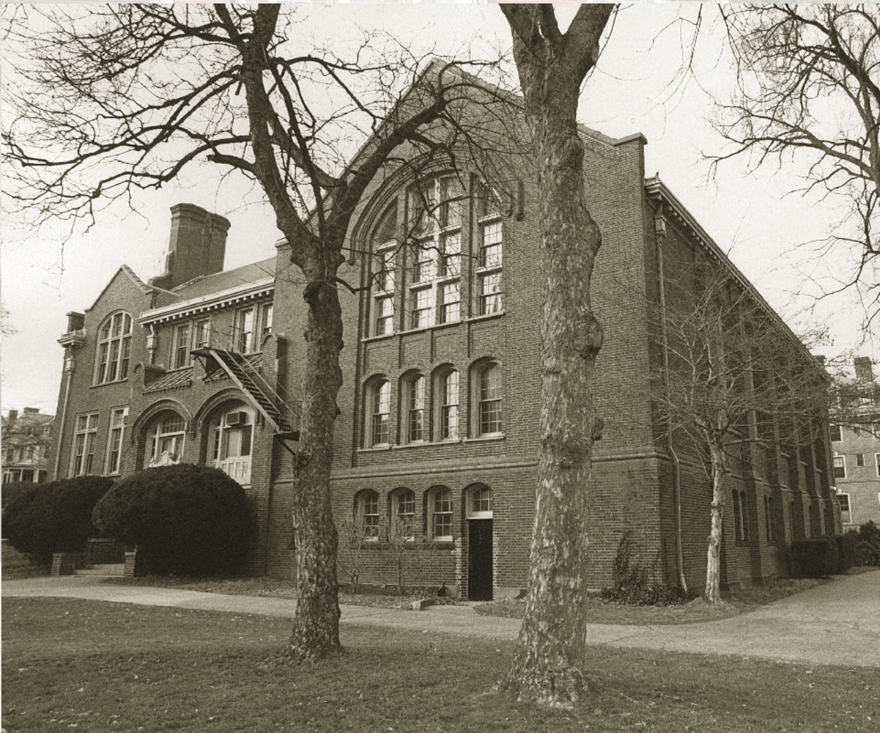
Sayles Gymnasium, now Smith-Buonanno Hall.