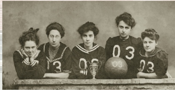
A photo from the earliest days of women's basketball

The first women's tennis team begins to compete against other colleges.