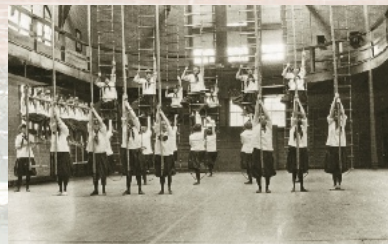
A rope and ladders exercise in Sayles Gym.

Frank Sayles, Class of 1890, contributes $50,000 for the construction of Sayles Gym, to be used for women's athletics. The facility included a running track, basketball court, locker room space, and two bowling alleys. The gym remained active until the 1990s, when it was remodeled for classrooms and renamed Smith-Buonanno Hall.