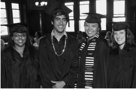
2010 Gender and Sexuality Studies concentrators celebrate their graduation in Pembroke Hall

The problem for the concentration has been its inability over the years to obtain any secure faculty lines or half lines that could guarantee the integrity of its course offerings. In spite of dedicated faculty leadership over decades, Brown's Gender and Sexuality Studies program remains far behind those of comparable institutions in terms of institu-