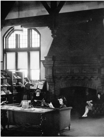
Students using the Pembroke Library on the third floor of Pembroke Hall.

Like many institutions in the late 1960s, Brown reformed its undergraduate curriculum in response to far-ranging concerns about the relationships of academic learning to questions of social justice, of democratic governance, of war and peace. Unlike that of most other institutions, Brown's reformed curriculum of 1969 was so well conceived, so smart in the structural mechanisms it provided for the fostering of liberal learning, that more than forty years later it remains the "New Curriculum" for undergraduate education. 2 The curricular changes brought dramatic results: Brown became highly competitive among undergraduates, and the institution became known as a place for exciting intellectual work. The University had embraced a powerful idea—the idea that guided the "Modes of Thought" courses so important to the New Curriculum: that how we know, how we think, is no less important than what we know.