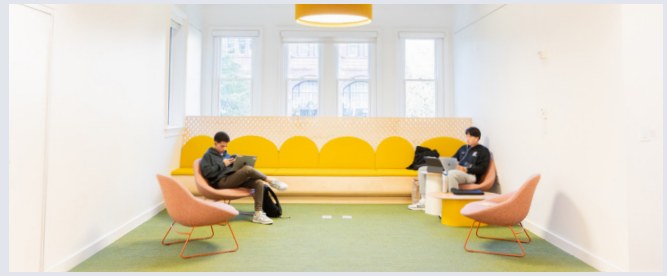
▲ One of the lounge areas in Pembroke Hall

The final, most noticeable changes to Pembroke Hall are to the large third-floor multipurpose event room. Designed in 1897 to house student activities, physical education classes, and once-mandatory Pembroke College chapel services, the room has served many purposes in the years since. Post-renovation enhanced acoustics, upgraded audiovisual systems and lighting, and new furnishings have significantly improved the experience of attending an event in the room. The space is now in high demand by departments across campus for events such as lectures and book talks.