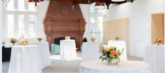
▲ The third floor event space has updated soundproofing, A/V, and furnishings.

“At a time when the work that’s being done at places like the Pembroke Center is under attack, we are doubling down. It’s more important than ever that we at Brown continue to demonstrate and elevate how important this scholarship is. This renovation is a reflection of Brown’s enduring commitment to inquiry that is bold and transformative. This space will be a new home for the next generation of scholars who will ask the hard questions and imagine new possibilities.”