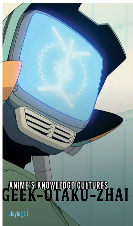
▲ Li’s 2024 book, Anime’s Knowledge Cultures