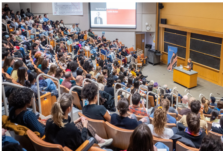
▲ Judith Butler delivers the 2025 Pembroke Publics Lecture.

Judith Butler delivered their talk “Variations of Legal Violence” to a packed audience in MacMillan Hall on November 5, 2025. Invited as the 2025–26 Pembroke Publics speaker, Butler, a feminist philosopher and gender and sexuality studies scholar, used Franz Kafka’s 1925 novel The Trial (about a man prosecuted for breaking an unidentifiable law) to bore into questions about how the law works, “if it works at all.” Butler considered how and when the law not only excludes people from legal protections but subjects them to such legally sanctioned cruelty as indefinite detention. When an appeal to the law brings not justice but humiliation, Butler asked, where are we to seek justice? In the face of thwarted narrative expectations that would offer any legal rationale, Butler called for a broader political understanding of justice arising from collective action. The recording of this talk is available on the Pembroke Center YouTube playlist .