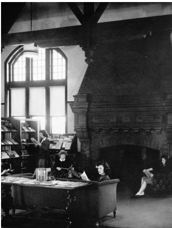
Students using the Pembroke Library on the third floor of Pembroke Hall.

Like many institutions in the late 1960s, Brown reformed its undergraduate curriculum in response to far-ranging concerns about the relationships of academic learning to questions of social justice, of democratic governance, of war and peace. Unlike that of most other institutions, Brown's reformed curriculum of 1969 was so well conceived, so smart in the structural mechanisms it provided for the fostering of liberal learning, that more than forty years later it remains the "New Curriculum" for undergraduate education. 2 The curricular changes brought dramatic results: Brown became highly competitive among undergraduates, and the institution became known as a place for exciting intellectual work. The University had embraced a powerful idea—the idea that guided the "Modes of Thought" courses so important to the New Curriculum: that how we know, how we think, is no less important than what we know.